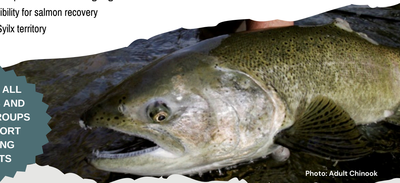
Photo: Adult Chinook

CALLING ALL ANGLERS AND FISHING GROUPS TO SUPPORT TRACKING EFFORTS