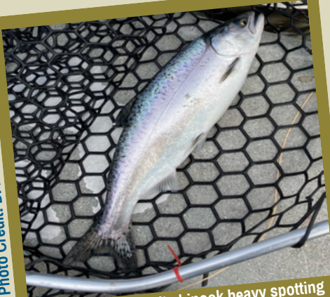
Trail, BC: Sub-adult chinook heavy spotting on back, and top and bottom of tails