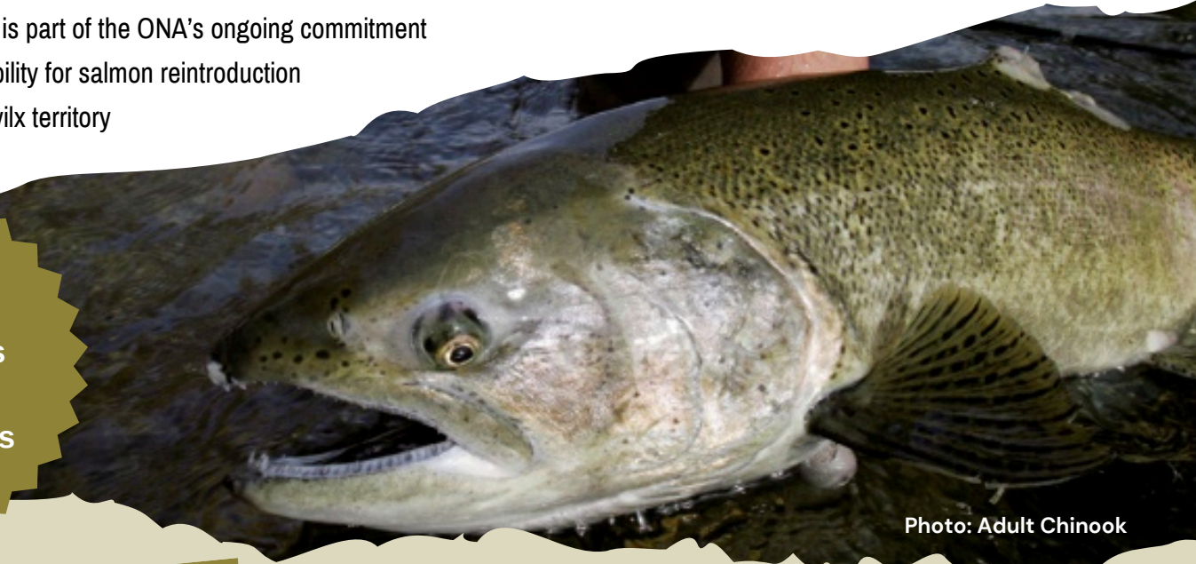
Photo: Adult Chinook

Calling all anglers and fishing groups to support tracking efforts