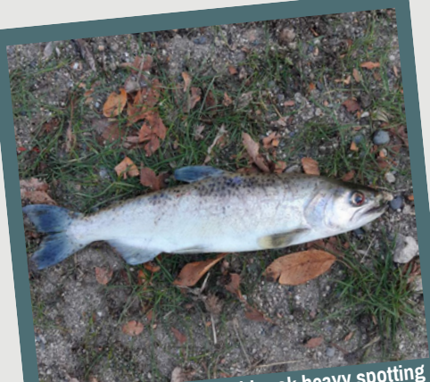
Oliver, BC: Sub-adult Chinook heavy spotting on back, and top and bottom of tail

We are encouraging all anglers that encounter a Chinook to minimize handling and to release them unharmed. If you happen to keep a Chinook, they may contain a small wire tag (PIT tag) approx. 12 mm in length to track their behavior and survival. Please contact the ONA to submit PIT tags or report Chinook encounters.