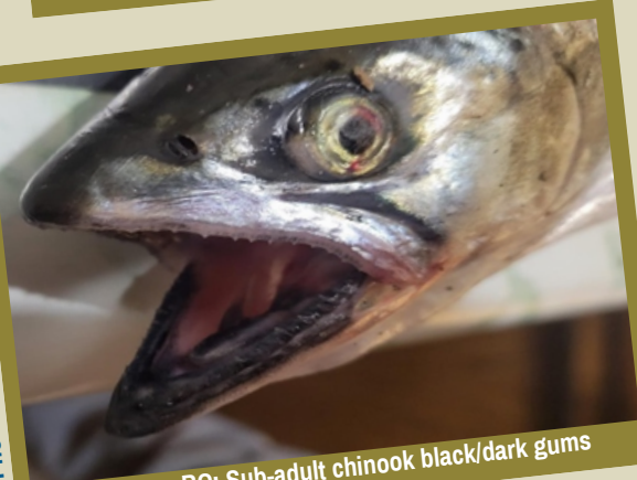
Castlegar, BC: Sub-adult chinook black/dark gums