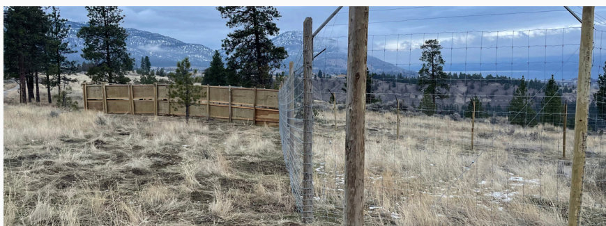
yilíkwłxkn (Bighorn Sheep) Pens: fence maintenance, 2024)