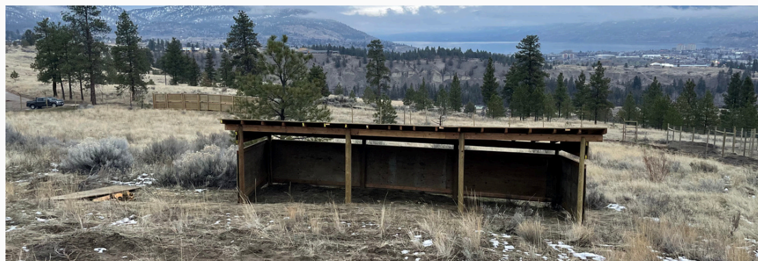
yilíkwłxkn (Bighorn Sheep) Pens: wind shelter, 2024)

Psoroptic mange, caused by mite infestations, severely impacts yilíkwłxkn health, causing sores, hair loss, inflammation, and scabs. In severe cases, thick ear crusts impair hearing, increasing predator vulnerability. These mites, non-contagious to humans, can survive without a host for over a month in cold, dry conditions. As an indicator species, their health reflects the overall condition of their habitat. The threat of diseases like Psoroptic Mange underscores the urgent need for proactive management, as addressing these issues not only safeguards the yilíkwłxkn but also supports the health of other wildlife and livestock in the area.