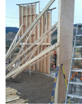
Construction taking place in preparation for the concrete pour of the walls.